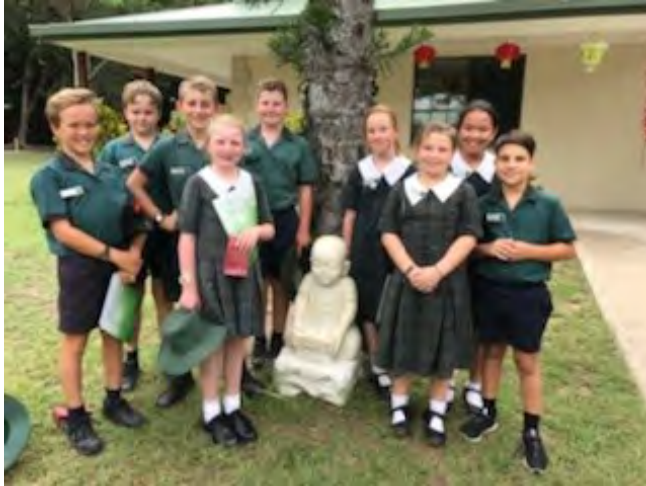
School Leaders at the Amitabha Buddhist Association in Brisbane.

Last Friday I had the pleasure of joining our Year 6 leaders on the Harmony Tour to Brisbane. As part of this tour, we visited three different places of worship in Brisbane. We visited a Hindu Mandir, a Buddhist Temple and a Sikh Gurdwara. At each of the places of worship, the students were given a tour and a talk about the greetings, Holy Scriptures and practices in that particular faith. The St Monica's Students on the tour were respectful and engaged throughout the day and were a credit to our school. This group will share some of their experiences as part of our school Harmony Day celebrations later in the year.